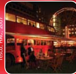
Tesco, HAC, 2007

"The prior planning and preparation produced a faultless execution on the day. An absolute triumph" Aston Martin