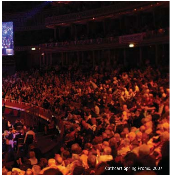
Cathcart Spring Proms, 2007