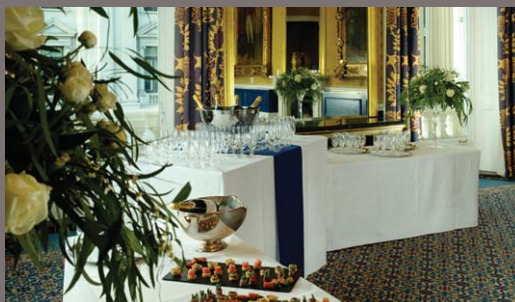
High Quality Catering